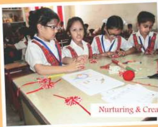
Nurturing & Creating artists