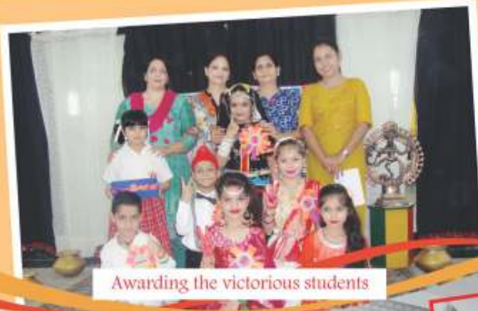
Awarding the victorious students