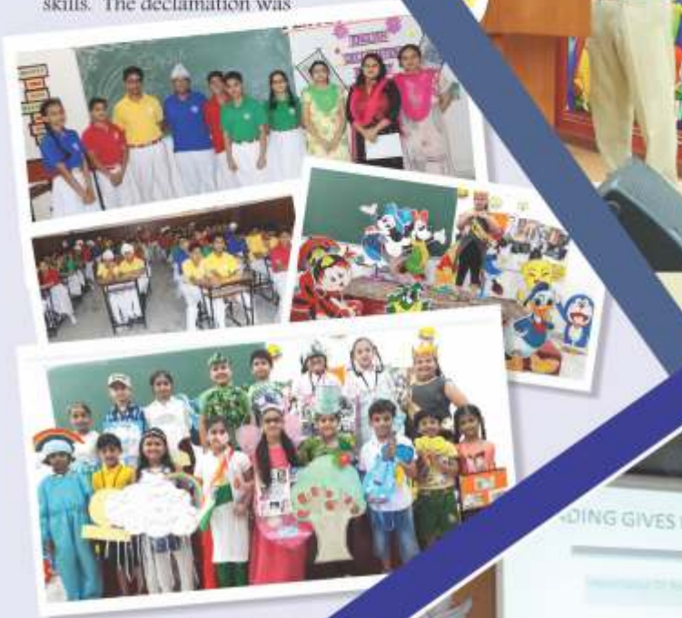
Poem Recitation Competition

The power of words and language expression was promoted by providing a platform to the students to exhibit their views & opinions through a Declamation Contest in order to enhance their public speaking skills. The declamation was