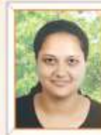
Akriti Eco.95, Eng.95 Painting 92