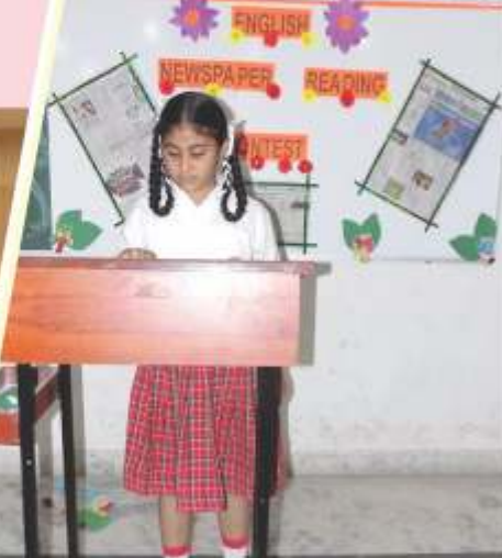
Newspaper Reading Competition