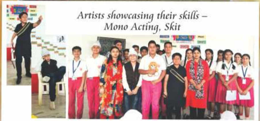
Artists showcasing their skills – Mono Acting, Skit