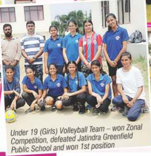
Under 19 (Girls) Volleyball Team – won Zonal Competition, defeated Jatindra Greenfield Public School and won 1st position