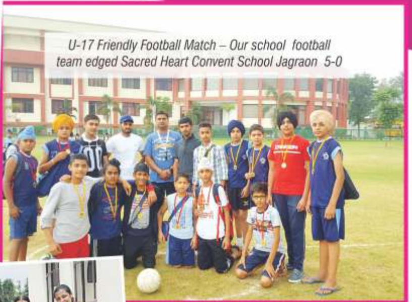
U-17 Friendly Football Match – Our school football team edged Sacred Heart Convent School Jagraon 5-0