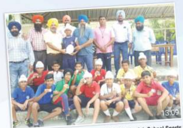
U-14 (Boys) Football team got Silver Medal in Punjab School Sports