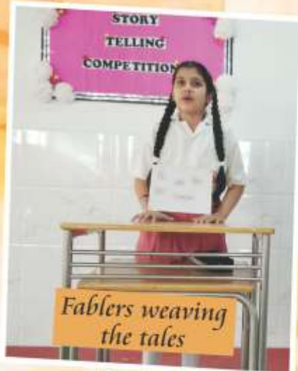
Fablers weaving the tales