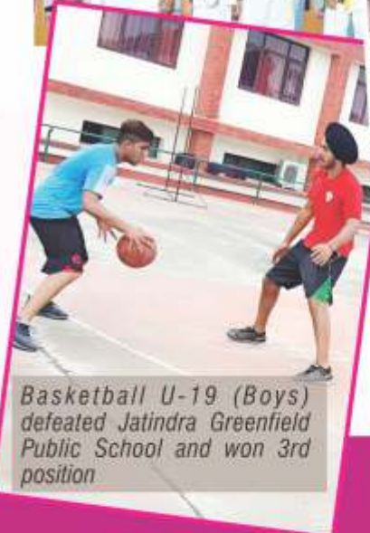
Basketball U-19 (Boys) defeated Jatindra Greenfield Public School and won 3rd position