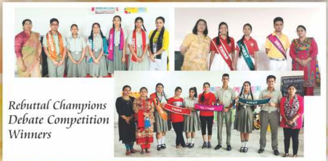
Rebuttal Champions Debate Competition Winners