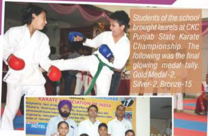
Students of the school brought laurels at CKC Punjab State Karate Championship. The following was the final glowing medal tally. Gold Medal -2, Silver-2, Bronze-15