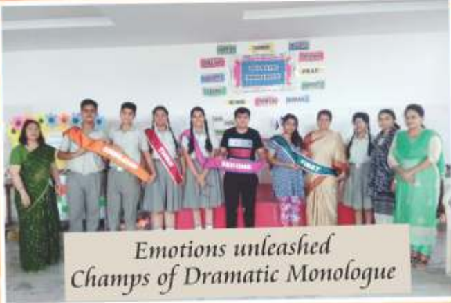
Emotions unleashed Champs of Dramatic Monologue