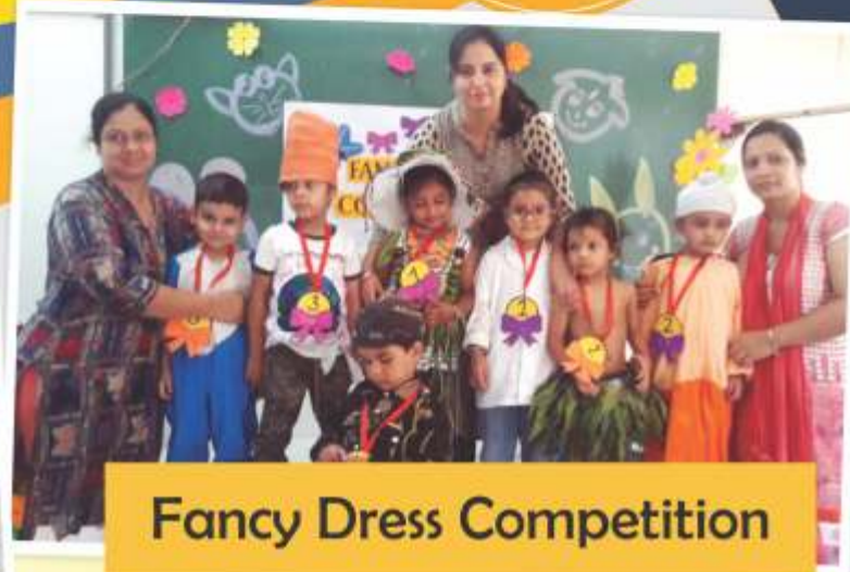
Fancy Dress Competition

Fledgling Probers – Maths & Science Model Making