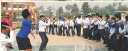
Jr. NBA Reliance Foundation